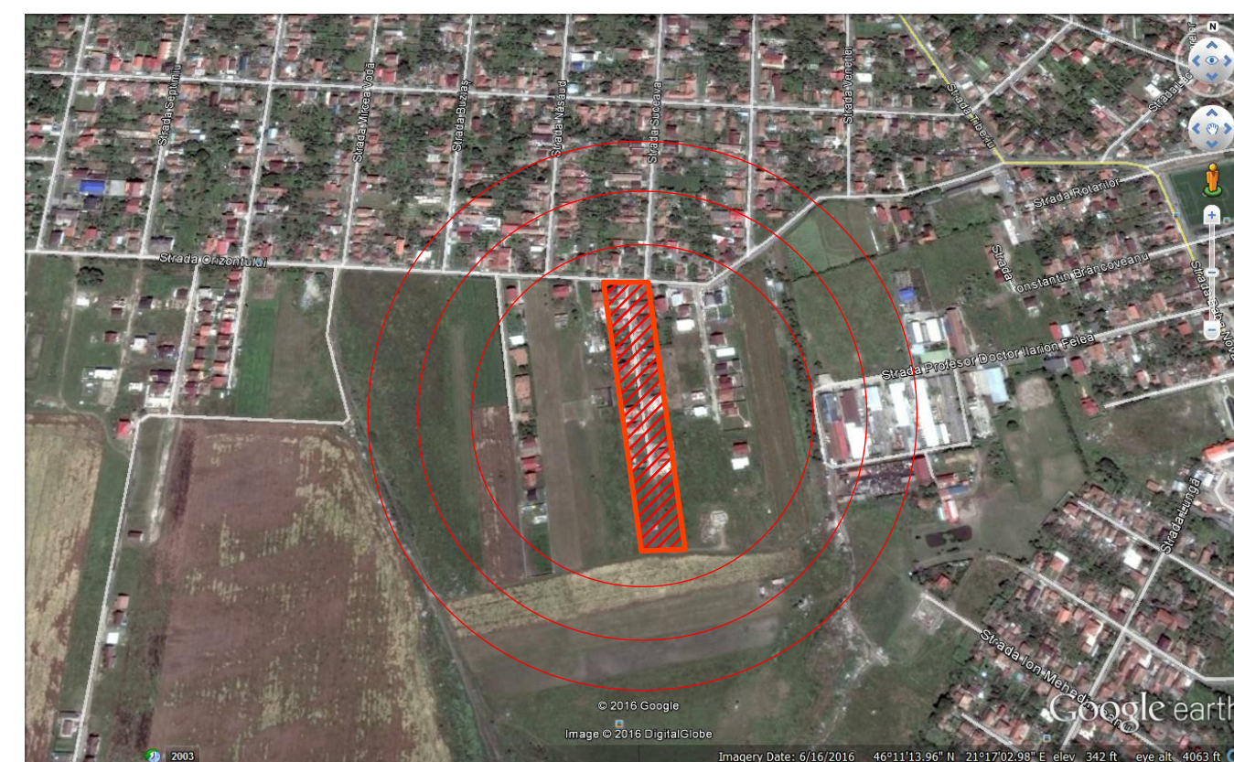
PLAN INCADRARE ZONA Scară 1:10000

PUD aprobat HCL 301/2007 Beneficiar: GABOR PETRU